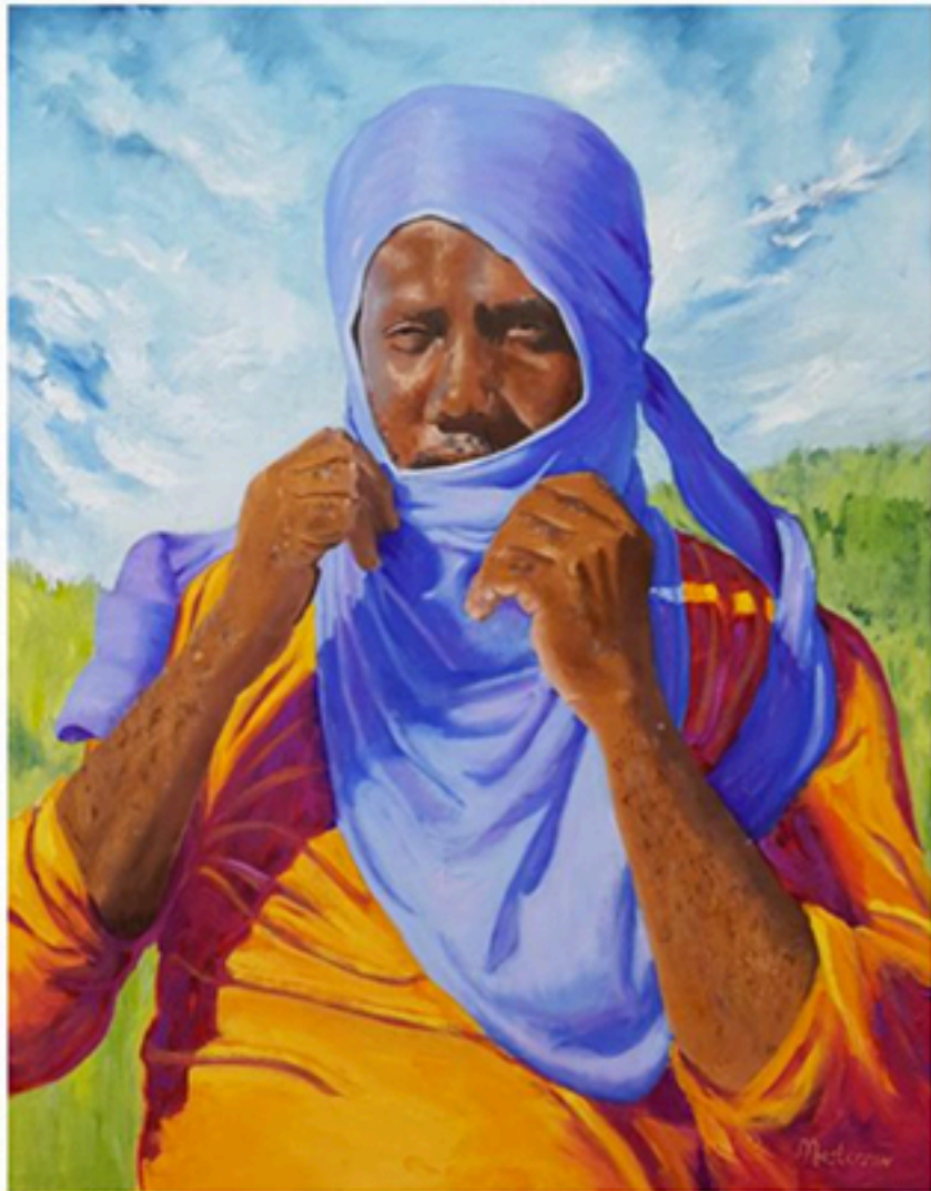
THIS PAGE TOP LEFT: Waiting (2017, o/c 30x40) ABOVE: Peaches Picking Apples (2017, o/c 16x40) LEFT: Abraham (2016, o/c 24x30)