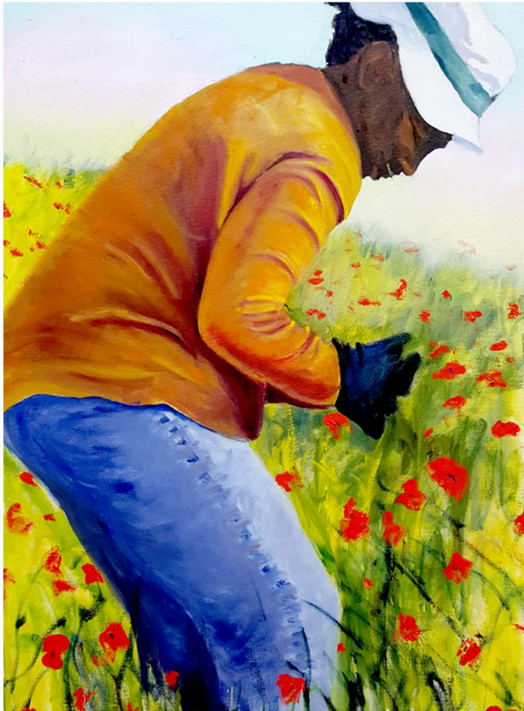
PAGE 13 Vincent With Apples (2017, oil on canvas, 30x40)